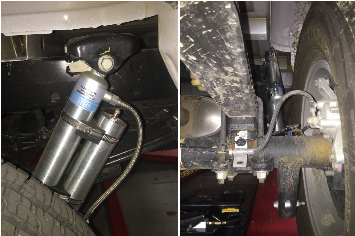
Figure 2. Rear passenger side